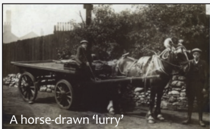
A horse-drawn 'lurry'