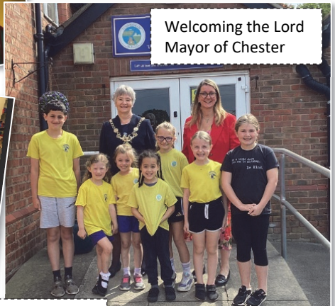
Welcoming the Lord Mayor of Chester