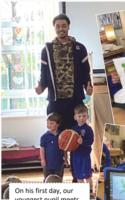
On his first day, our youngest pupil meets our tallest ever visitor!

Coming soon... The Dogs Trust will be doing dog training for young dogs at the school on a Tuesday night, 6–8 pm. Look out for further details on their website: www.dogstrust.org.uk/dog-advice/dog-school/shropshire