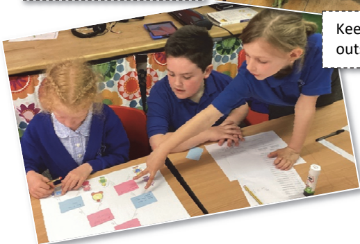
Keeping busy inside and outside the classroom