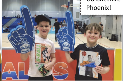
Go Cheshire Phoenix!